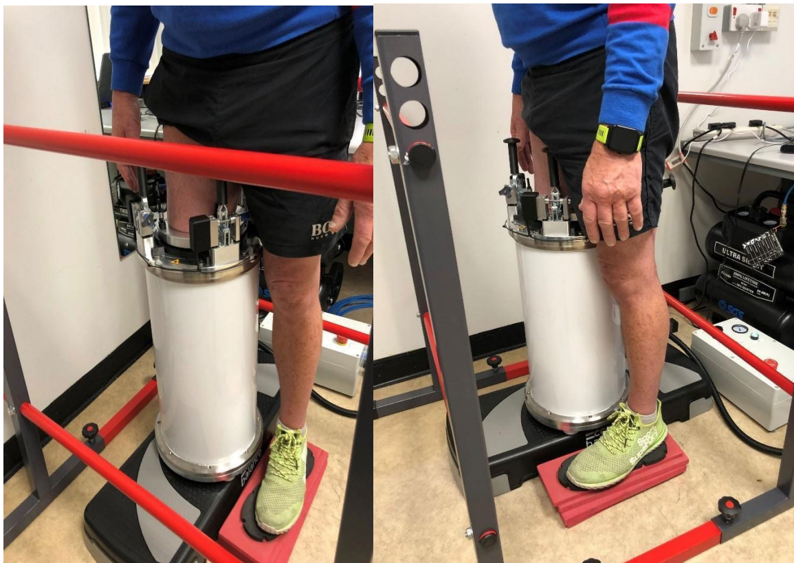
Figure 6: PCAD transtibial residual limb shape capture clinical investigation.

Results demonstrated considerable potential for time savings with accurate scanning when using the PCAD system. Further technical refinement is needed to optimise the sealing process and height adjustment mechanism in order to enhance user experience, improve the process of physical entry to the system, and improve scan quality and efficiency. Funding has been secured to advance these developments (TRL 6/7) within the medical device regulatory framework (Figure 6).