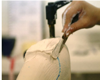
Figure 2: Conventional transtibial residual limb shape modification using Plaster of Paris.

Modification has demonstrated variable results between and within clinicians (Figure 2) 7 . The resulting socket fit is variable and may result in pain, skin breakdown, and socket refit. Additional appointments are inconvenient for prosthetic users as they are inefficient to clinical services and may result in increased travel (increasing environmental impact) and waste of materials should socket remakes be required 8 .