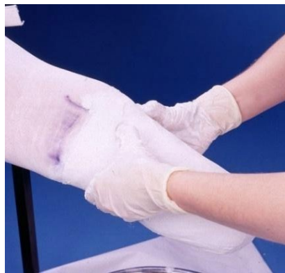
Figure 1: Conventional transtibial residual limb shape capture using Plaster of Paris.

Traditionally, when a person is deemed to need a new artificial limb, their residual limb is cast to capture the shape (Figure 1).