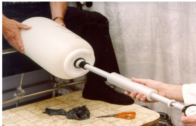
Figure 3: Pressure casting transtibial residual limb shape capture using Plaster of Paris (Ossur Icecast™).

Pressure systems using air and water are commonly used to capture shape to simulate loaded conditions. Shapes captured under pressurised conditions have demonstrated the creation of prosthetic sockets with lower peak pressures in a more repeatable manner with no modification required (Figure 3) 9 . Current pressure systems use traditional messy Plaster of Paris or expensive direct socket manufacture techniques to capture shape.