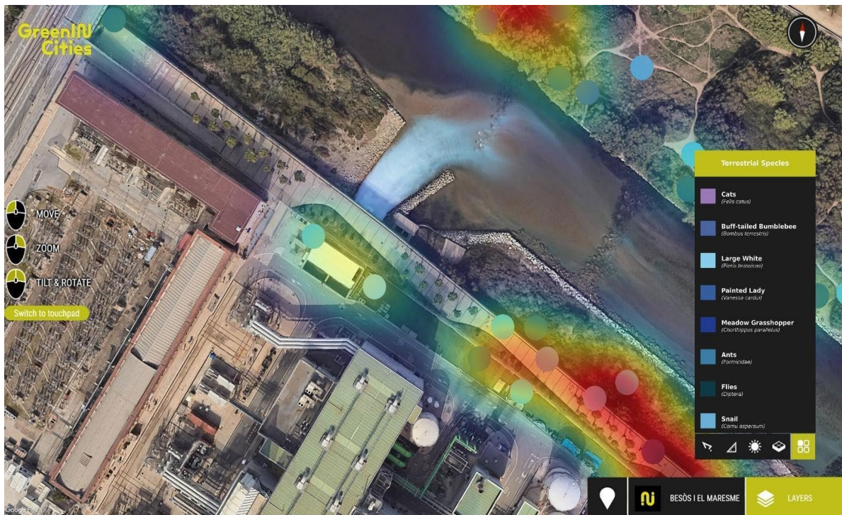
Figure 3: Local fauna detection outputs (terrestrial species) from direct observation and use of iNaturalist integrated into the digital twin as heat maps.

concrete stayed closer to 25–30 °C, and vegetated surfaces remained around 20–25 °C. This provided an evidence base for identifying hotspots, testing cooling strategies, and evaluating the implications of design interventions for both human and non-human comfort.