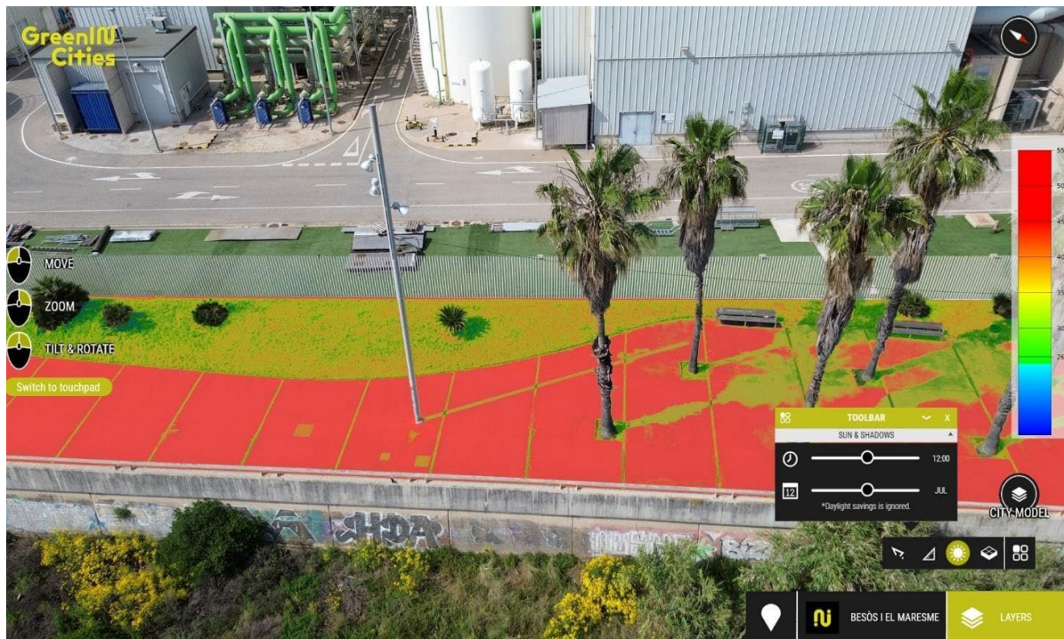
Figure 4: Map of surfaces temperature layer integrated within the digital twin as thermal map.