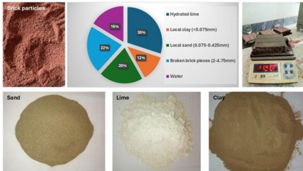
Figure 1: Ingredients, composition, and casting of prototypes.